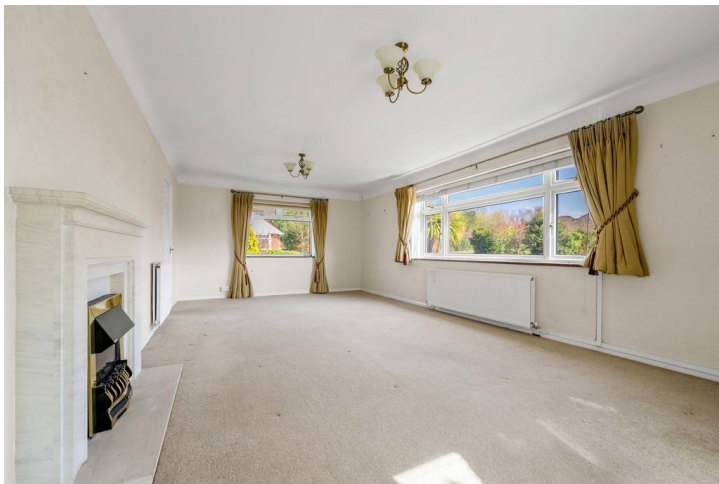
aspect window overlooking the garden.